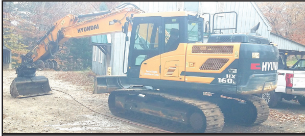
2018 HYUNDAI HX-160LC-9. 2,300 Hours, Dig/Grade Buckets, Hydraulic Thumb, Blade, Gorilla GXS-120 Hammer, $134,000.