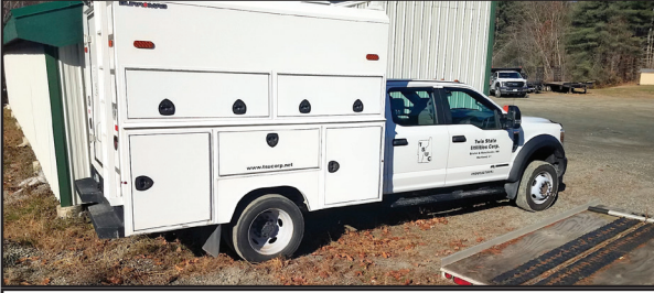
(2) 2019/2020 FORD F450XL. 4WD, Crew Cab, Diesel, 64k And 75k Miles, Duramag Custom Aluminum Body. $65,000. And $62,000.