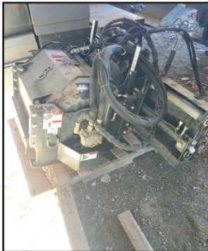
2018 BLUE DIAMOND 24" COLD PLANNER. Tilt/Side Shift, 12 Hours Of Use, High Flow, $16,500.