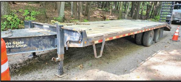
2019 KAUFMAN 25K TRAILER. Dual Tandem, Electric Brake Trailer, Ext Ramps. $8,500.