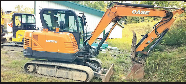
2019 CASE CX57. Dig/Grade Buckets, 2,327 Hours, Hydraulic Thumb, $54,000.