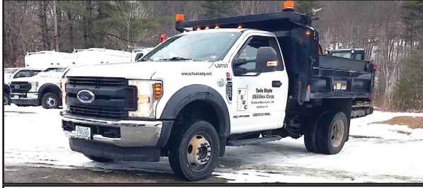
2019 FORD F550XL. 4WD, Diesel, Reading Dump Body, Pintle, 65k Miles, $42,000.