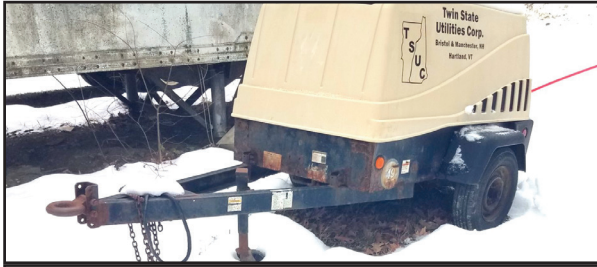
2012 INGERSOLL RAND COMPRESSOR. 1,475 Hours, Diesel, $9,200.