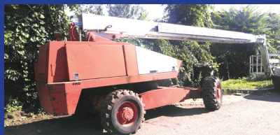
SNORKEL PRO 66DZ BOOM LIFT, 4WD, Deutz Diesel. New All Terrain Tires, Runs & Works Excellent, Only 5800 Original Hours, 66' Reach, $11,900/BO