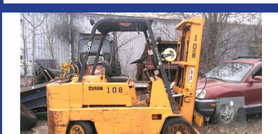
CLARK FORKLIFT. 8,000# Capacity, Triple Mast, 6 Cylinder, Propane Power, 48" Forks, Only $4,000