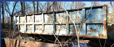
28' STEEL DUMP TRAILER. Good Condition, Great Scrap Hauler, Needs Paint, Only $6,500/BO