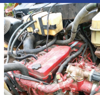
2008 CUMMINS 6.7L DIESEL MOTOR, Only 140,000 Miles, $2,750