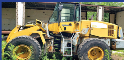
DISMANTLING KOMATSU WA340 LOADER. Parting Out, Motor Is Stuck, Everything Else Is Good, Including Quick Coupler, Call With Your Needs, Good Motor Is Available