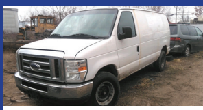
2010 FORD E250 Super Duty Work Van. Runs & Drives Great. Excellent Body. Fleet Maintained. Cat Was Stolen. We Are Putting On Flex Pipe. A Steal, $7,200/BO