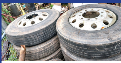
ALCOA 22.5 ALUMINUM 10 LUG HUB PILOT TRUCK RIMS. Only $1,000 For Rims Or $1,600 Rims & Tires