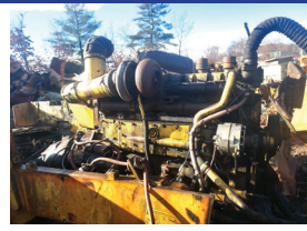
CUMMINS KT 19-C 19 LITER MOTOR. 450 HP, From Large Earth Mover, Only $4,500/BO, Priced For Quick Sale