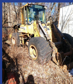
1995 VOLVO L-90B LOADER. My Own Machine, Parting Out, No Motor, Call With Your Needs