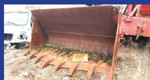
BIG BUCKET FOR CAT 988-992 LOADER. Model #53517/6K8346, Ser# 5K5339, Superb Condition, Call For More Details, Only $4,950/BO