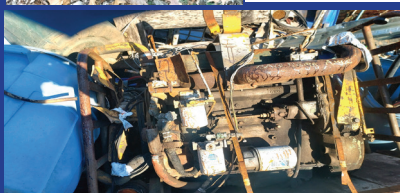
DETROIT DIESEL 4-53 MOTOR. Runs Great, Only $1,500