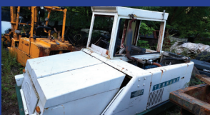
TENANT SWEEPER Runs And Works Well. BRAND NEW KUBOTA 4 Cyl Diesel Motor. Not Pretty, But Works Great. Only $3,000 !