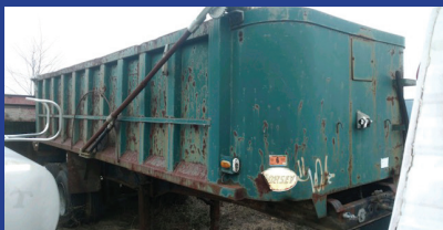
GREAT DANE 22' STEEL DUMP TRAILER. Good Condition, Only $5,500/BO Call For More Info

* ALL FERROUS & NON FERROUS METALS* COPPER/BRASS/ALUMINUM/STAINLESS/IRON & STEEL* MACHINERY* HEAVY EQUIPMENT* CARS/TRUCKS*