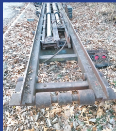
GALBREATH ROLL OFF HOIST. 65K Capacity, Complete w/ Lift Cylinders, Reeving Cylinders, Oil Tank, Control Valves, Hold Downs, Ready To Drop On Your Frame, Only $2,500