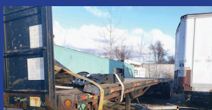
2004 MANAC 48' FLATBED TRAILER. Good Tires & Brakes, Sliding Strap Winches, $6,000/BO