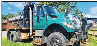
2011 INTERNATIONAL 7400. 315 HP, Allison Trans, 16 F/A, 30 R/A Locker, Pwr Rev Plow, Also, 2012 Just Arrived.