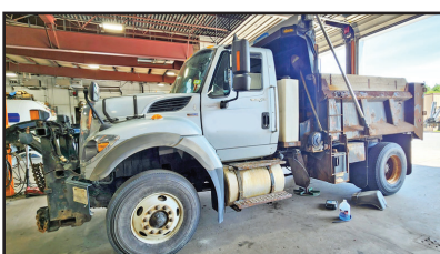
2012 INTERNATIONAL 7500. 310 HP, Eng Brake, Allison W Retarder. 16 F/A, 30 R/A, All Options, Air To Rear, Fully Equipped. Due In Soon.