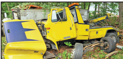
HEAVILY DAMAGED WRECKER. T444E Engine, 5 Speed Trans., For Parts, Single Winch, $2,500.