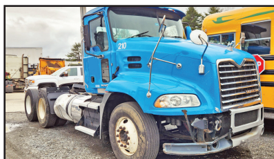
2012 MACK GRANITE. MP7 Mack Engine, MDrive Tans, 12K F/A, 40K RS405 Rears, 3.55 Ratio, Jack Knife Accident Damage, Second Parts Mack Available Also.