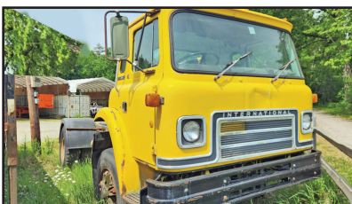
1982 INTERNATIONAL 1850 CABOVER. Rt Side Steer, 9.0L Diesel, Allison Auto, Air Brakes, Solid Unique Non-Running Project Truck, Asking $3,200.