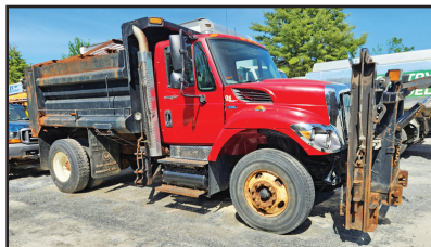
2008 INTERNATIONAL 7400. DT300 HP, 8LL Trans, 30K Locker, 41,100 GVW, Asking $19,500.