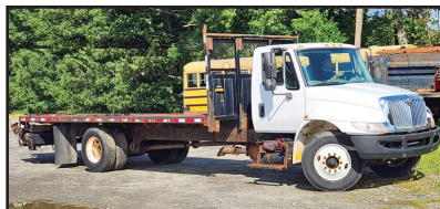
2011 4300. Maxxforce DT466, Eaton Autoshift A/B, Non CDL, Runs And Yard Drives, Needs Work. $3,200 As Is.