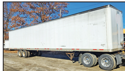
STORAGE TRAILER. Some Accident Damage, $1,400. (We Can Deliver For An Extra Fee)