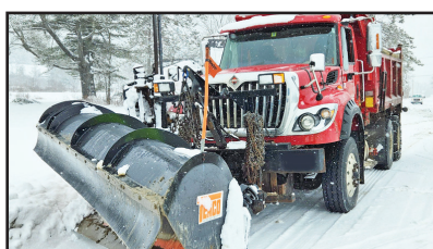
2011 INTERNATIONAL 7600 Tandem Axle Municipal Truck. Fully Equipped, 430 HP, 8LL 20/46 Axles, Side Dump, 85,000 Miles, Due In Soon.