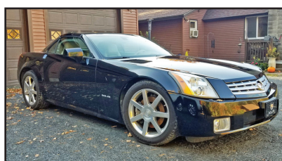
2004 CADILLAC XLR. Very Clean, Garage Kept, 45,000 Original Miles, Retractable Hardtop, Performance Roadster, Fun Car, $22,000., Trades Accepted