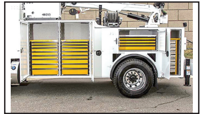
CTECH – Drawer Units That Fit Into Your Utility Body