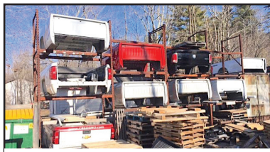
TAKE OFF BEDS. Ford – GM – Dodge Call With Your Specs