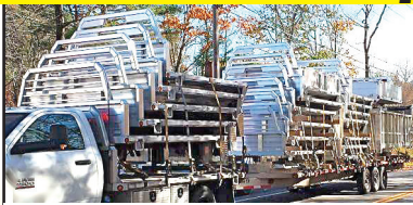
DURA MAG ALUMINUM FLATBED BODIES. Industry's Highest Quality, Call With Your Specs.