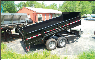
DUMP TRAILERS. 12', 14', 16 Ft. Twin Piston, Powder Coat, Ramps, Battery, Ready To Go