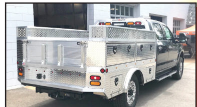
ALUMINUM SERVICE BODY