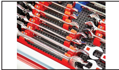
Drawer Tool Organizers – CTECH Storage Solutions