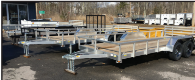
ALUMINUM LANDSCAPE TRAILERS