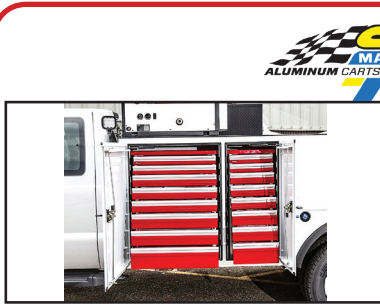
MOTIONLATCH TECHNOLOGY. One- Hand, One-Motion Drawer Pull. Dual Latches Keep Drawers Closed During Transit.