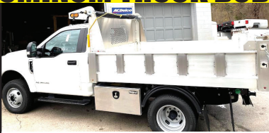
DURA MAG ALUMINUM DUMP BODIES Complete Sub-Frame, Power Pac, LED Lights.