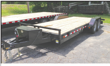
7 TON EQUIPMENT TRAILER . 20' Power Tilt, Tandem Axle, USA Made Also Aluminum Trailers