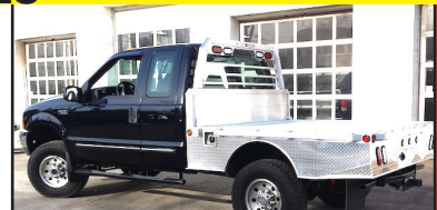
CUSTOM ALUMINUM FLATBED BODIES