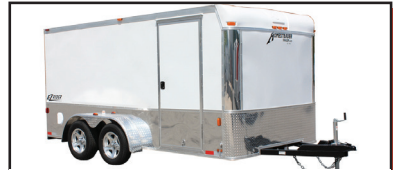
HOMESTEAD Enclosed Trailers. Stocking 8 Ft – 24 Ft